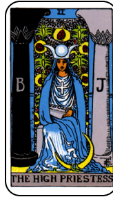
1. Sunday (Sun) The High Priestess