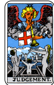
3. Tuesday (Mars) Judgement