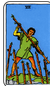
4. Wednesday (Mercury) Seven of Wands