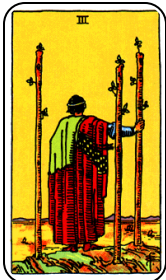
6. Friday (Venus) Three of Wands