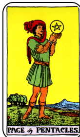
5. Thursday (Jupiter) Page of Pentacles